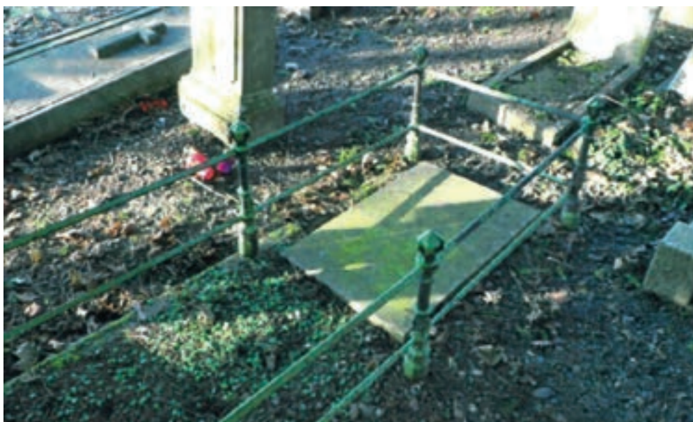
Prince Poniatowski original grave, prior restoration

The Prince Joseph Poniatowski grave restoration project in Chislehurst completed in 2014 by the Polish Heritage Society (U.K.), supported by the Embassy of the Republic of Poland in London