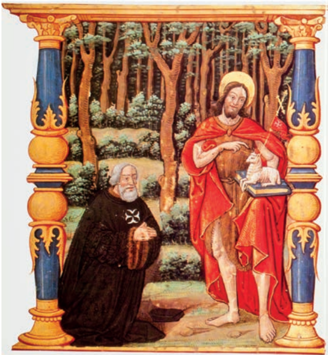
Grand Master Philippe Villiers de l'Isle Adam (44th Grand Master, 1521–1534) adoring the Angus Dei to which Saint John the Baptist, the Patron of the Order of Malta is pointing (British Library 5 ).