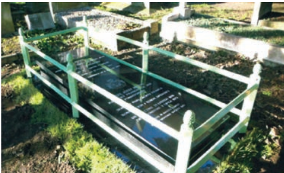
Prince Poniatowski grave, March 2014