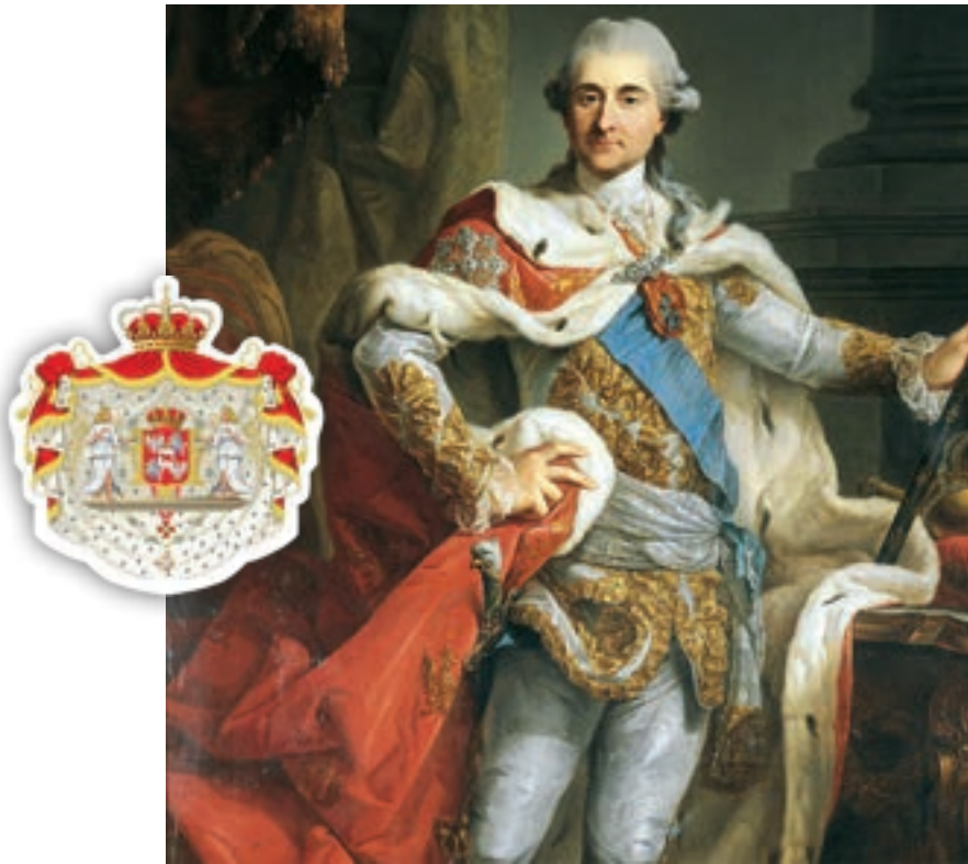
H. M. Stanisław August Poniatowski, last King of Poland