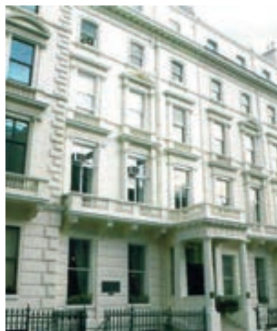
"Ognisko" after its refurbishment of facade by PHS

PHS has supported a major Polish Émigré Artists exhibition in The Graves Museum in Sheffield, which opened in January 2014.