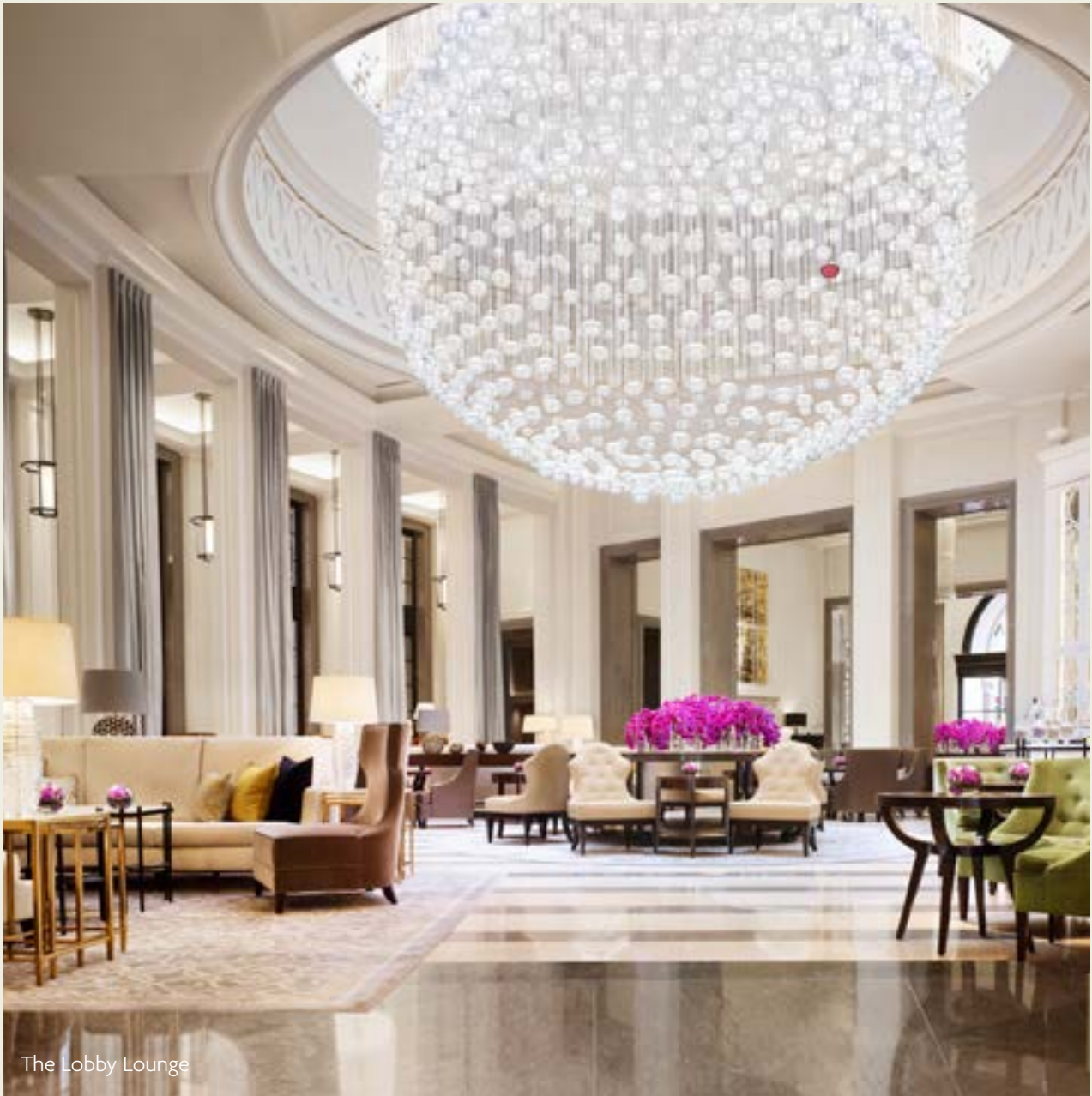
The Lobby Lounge