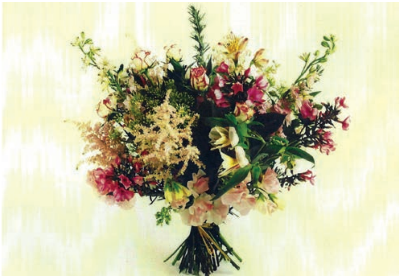
Lalage Barran Flowers, 2 Elmfield Road, London SW17 8AL Tel/Fax: 020 8675 2277 lalagebarranflowers@spitfireuk.net