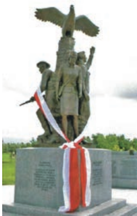
Polish Armed Forces Memorial at NMA

The Polish Heritage Society was created after the WWII Polish Armed Forces Memorial unveiling at the National Memorial Arboretum in Staffordshire in 2009. Some members of the Polish Allied Forces Memorial Committee, a Polish Committee that won The Dziennik Polski's "Organisation of the Year Award" in 2010, decided that the synergy created for the Memorial project should be harnessed and used to the benefit of the Polish Community in the United Kingdom. The Polish Heritage Society (PHS) was subsequently created in 2010 and was officially established in 2011 as a Charity limited by guarantee.